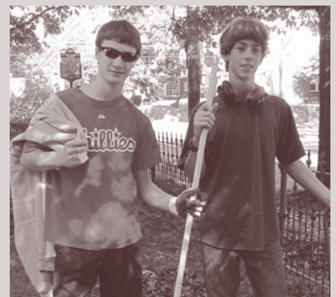
William Penn Charter students volunteer their time working in the garden.